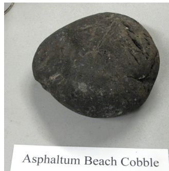
Asphaltum Beach Cobble