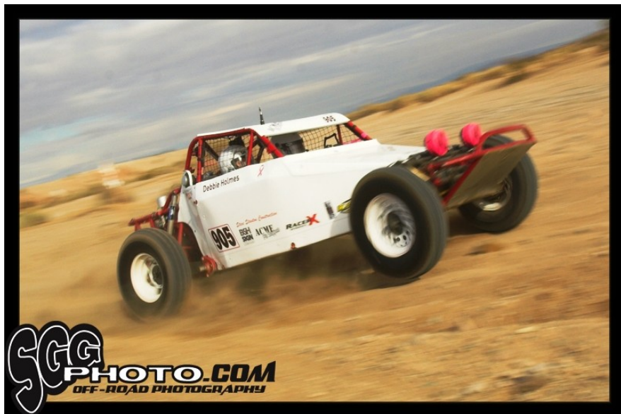
Michele driving off road. She has won first place in 2 races that are fundraisers for breast cancer.