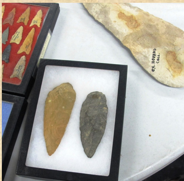
Arrowheads knife and tool making and flint knapping